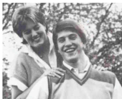
1985 Senior Superlatives