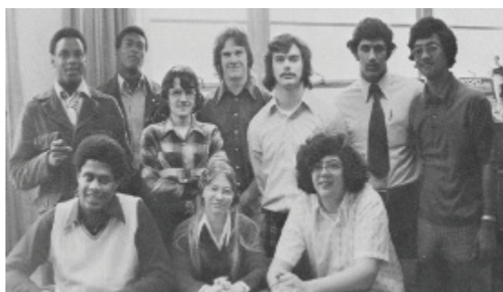
1975 Chess Club